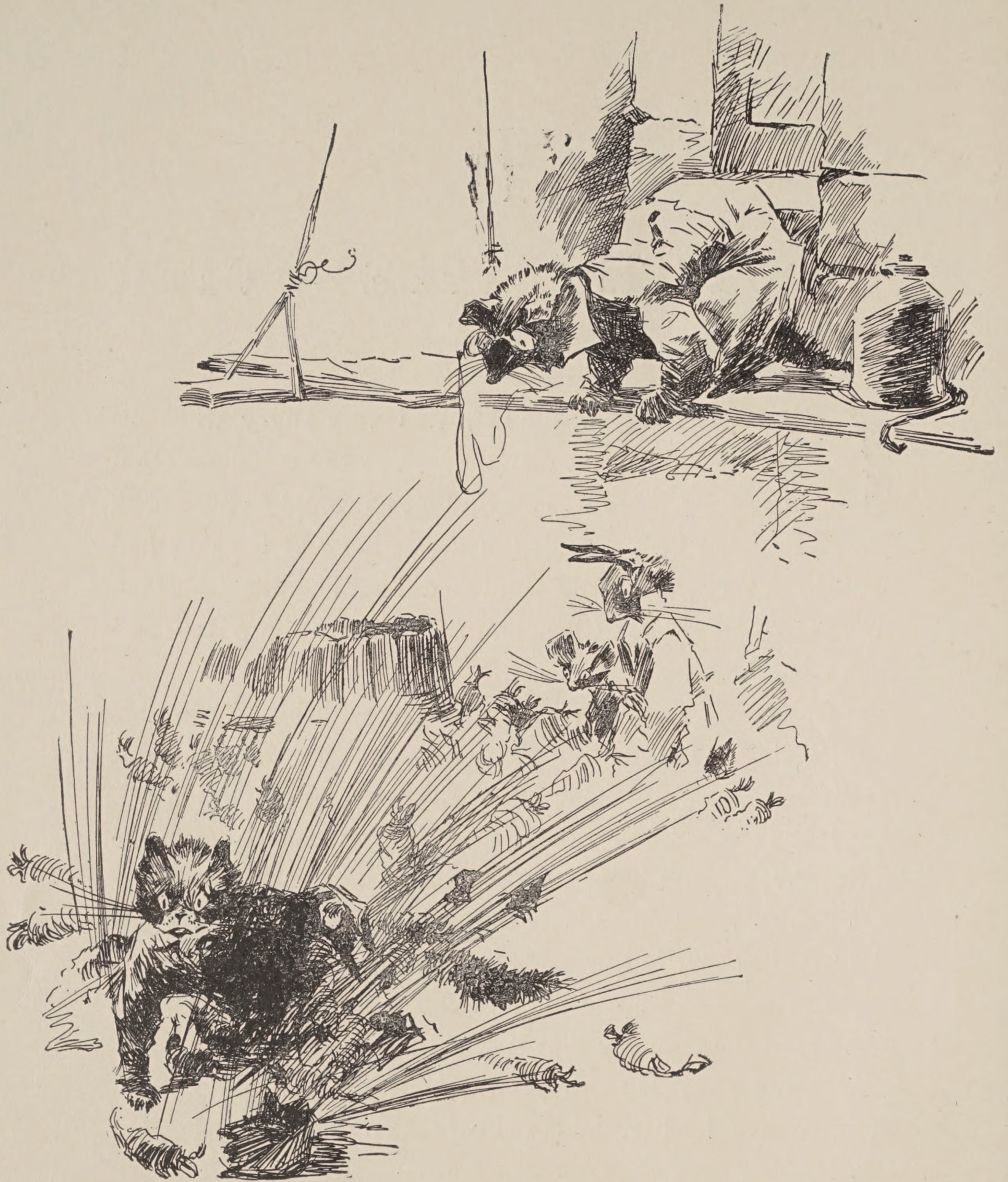
PATRICK O'POSSUM PUSHES OVER THE APPLE BUTTER JAR.